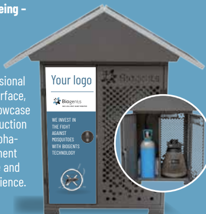
Optional metal enclosure equipped with solar panels

The high-quality metal enclosure serves as a professional communication surface, allowing you to showcase your mosquito reduction initiatives and emphasize your commitment to providing a safe and comfortable experience.