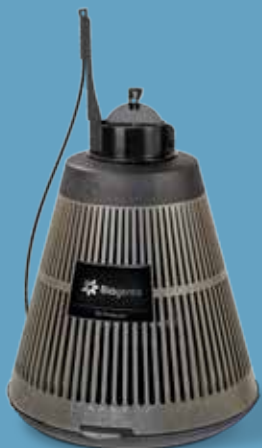
Imitates human presence (smell, CO 2 , air flow)

Support the purchase of traps by private individuals: partial refund on proof of purchase, group purchase, loan or donation.