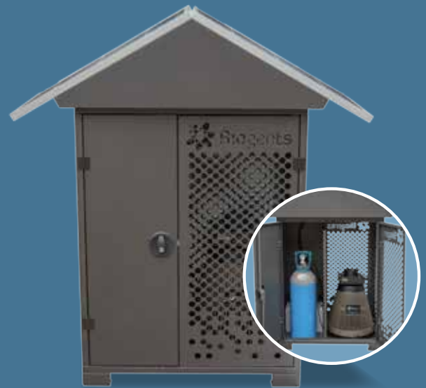
Metal enclosure equipped with solar panels

Parks, kindergardens, school buildings, outdoor sports facilities, cemeteries, etc.