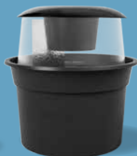
Imitates a breeding site